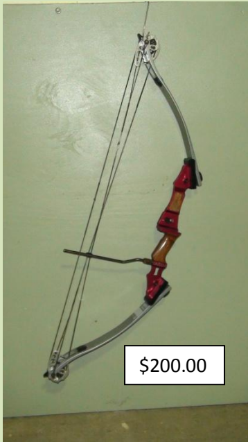
Martin Gazel LH 40lb max 24" -